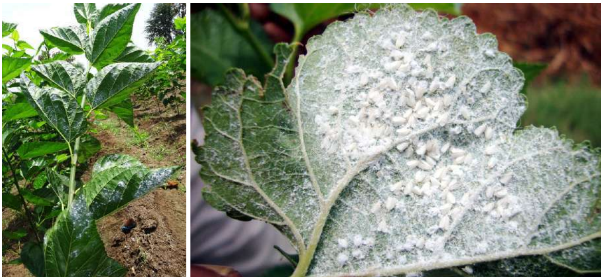
Spiralling whitefly affected mulberry plant & close up view

It is found to cause damage throughout the year with peak incidence during summer.