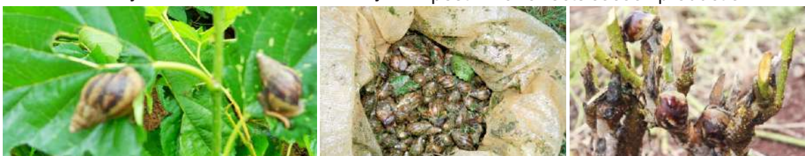
Snails collected from mulberry garden

Giant African snails are large in size (long, narrow and conical in shape, reaching a length of 20 cm), with a light brown shell to protect the body, having brown and cream bands alternatively lined. The shell size attains up to 5-10 cm. They are nocturnal in habit and hide beneath fallen leaves, inside peeled off mulberry bark or under stones during day time and come out from hiding places during night to attack host plants and cling to the dorsal and protected surfaces of leaves. Though bisexual in nature, self reproduction is not possible. They are active during rainy season. They start laying eggs beneath the soil, dried leaves or any debris 2-3 weeks after mating. Eggs are round, yellowish in color, surrounded by mucus substance and are laid in groups of 30 to 300 eggs. They lay about 1000 eggs during their life time of about 3 to 5 years with 2-13 egg clutches. The young ones attain maturity in about 9 weeks. They