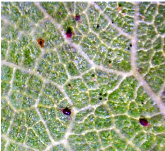
Mites on mulberry leaves