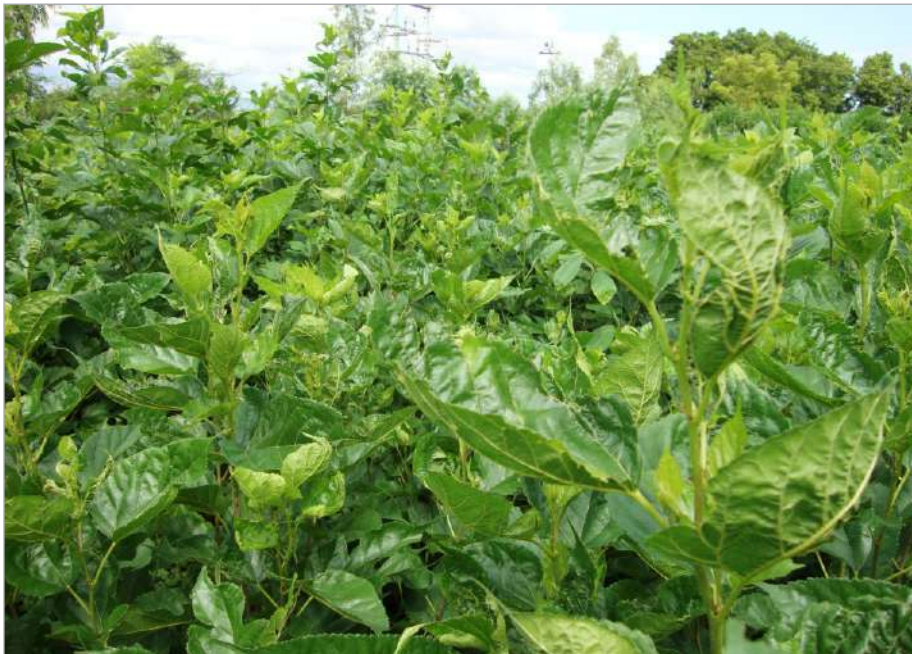
Jassid affected mulberry garden