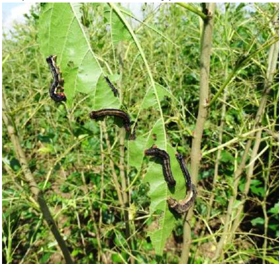
Defoliation by Tiracola

It is an occasional pest. According to the field level observations the pest seems to be seasonal and may undergo pupal diapause like other noctuids such as Helicoverpa armigera . Further studies are required to confirm this hypothesis.