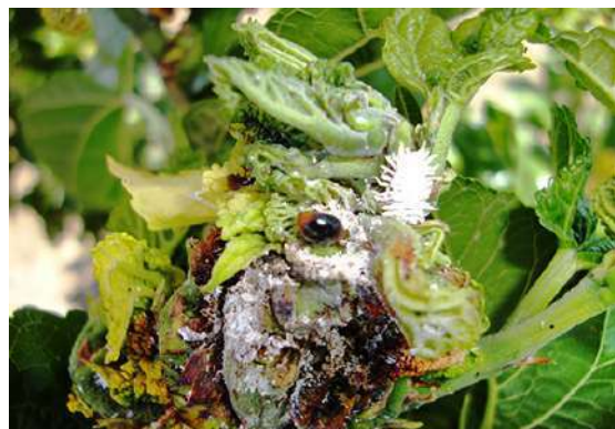
C. montrouzieri feeding on pink mealybug