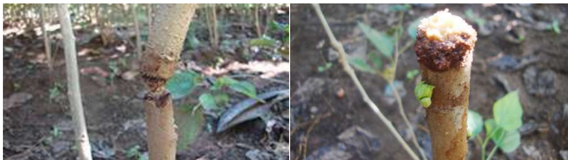
Mulberry stems attacked by S. grisator