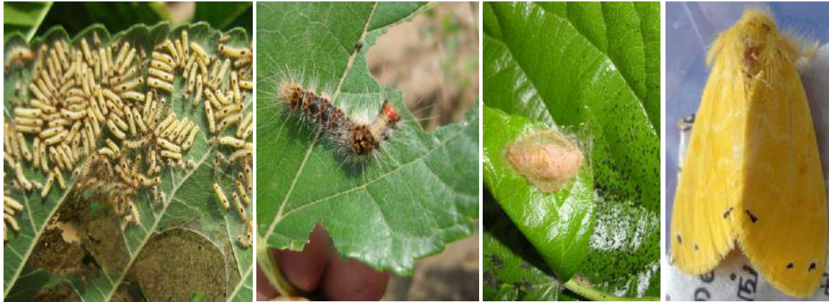
Different stages of E. fraterna