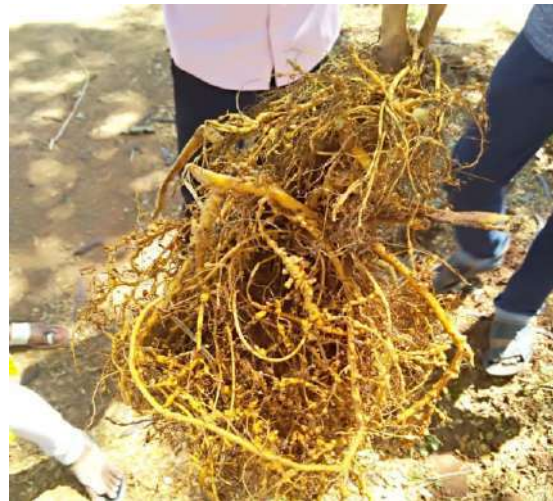
Mulberry root affected by nematodes

Severely affected mulberry plants show stunted growth with marginal chlorosis and necrosis of leaves. Knots / galls formed on the roots are spherical with varying size. Young galls are very small and yellowish white while old ones are big and blackish brown in colour. Due to this infection vascular tissues and cortex of roots are disorganized, hampering the translocation of water and minerals from soil to aerial parts of the plants.