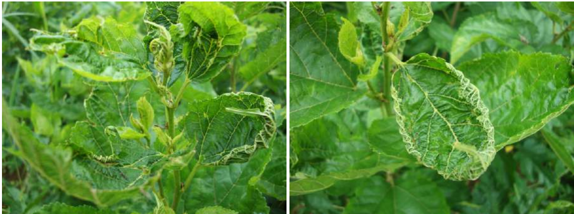
Hopper burn symptom in leaves