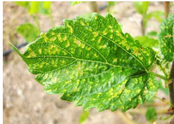
Symptom of thrips infestation