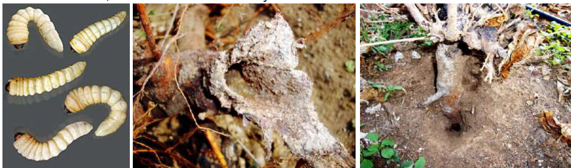
Batocera grubs tunnel in trunk & exit hole