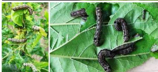
Different stages of S. litura