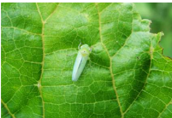
Nymph & adult stages of Jassid

the abdomen. The nymphs resemble adults, but they lack wings until the fourth instar. Adults and nymphs move sideways. Female lays 20-30 eggs on the lower surface of the leaves below the epidermis. Eggs are pale yellow in color & elongated in shape. The egg hatches into nymph within 6-13 days. The nymph undergoes five instars and becomes adult in 8 to 22 days. Nymphal period is 19-27 days. Pupation takes place on the leaf itself. There are 10-12 generations in a year.