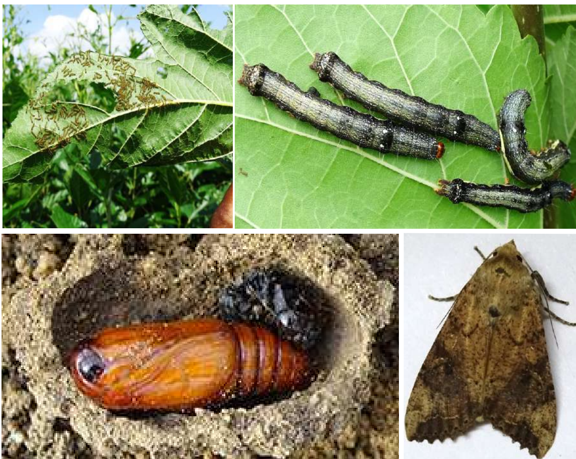
Tiracola sp. (Larva, pupa and adult moth)

match with the documented species in India and further examinations needed for species level identification. The adult moths are brown with a light and dark pattern as well as dark patches on the costa of each forewing. The hind wings have plain brown fading towards the bases. Female moth lays cream colored eggs in patches on the underside of tender leaves and sometimes on the leaves situated in the middle portion of the plants. Neonate larvae are mottled black with white hairs. The dorsal region of grownup larva is light brown in colour with irregular white patches and mottled black