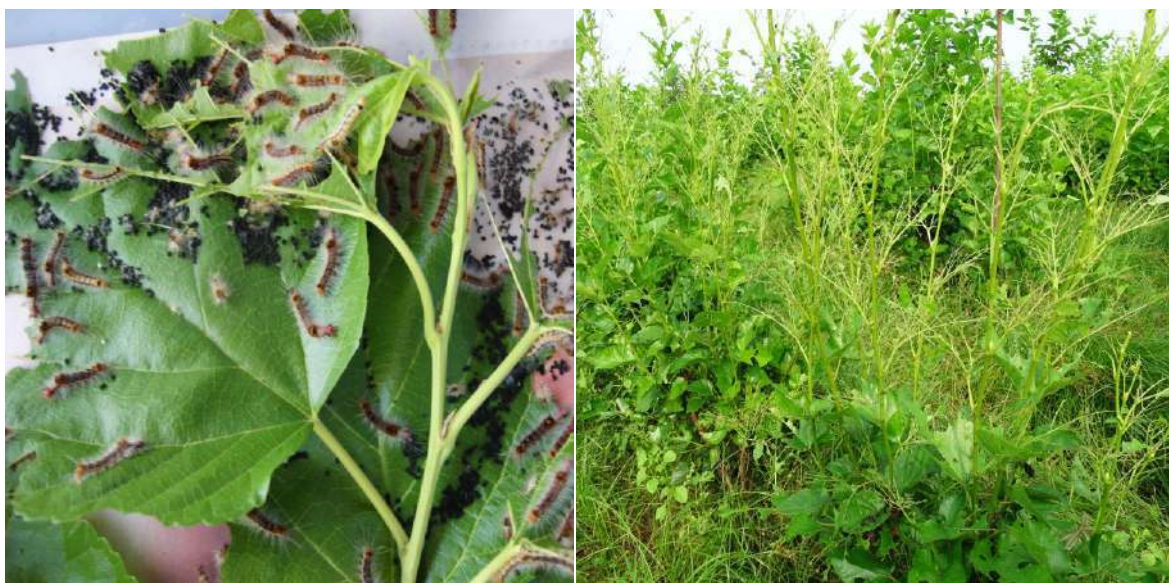
Defoliation by E. fraterna