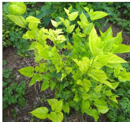
Chlorosis & stunted growth due to nematode attack in root.