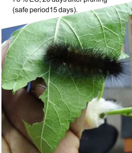
A. passalis larva