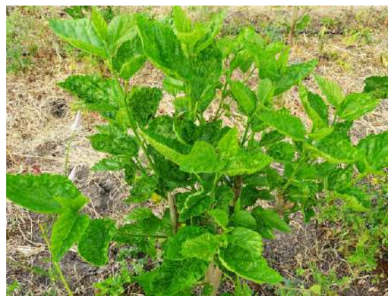
Thrips affected mulberry plant with stunted growth