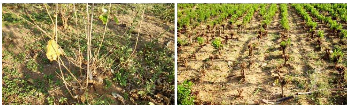
Mortality of plants in Batocera affected mulberry garden