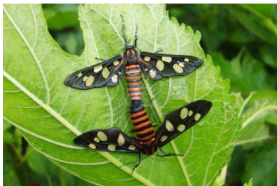
Wasp moth, A. passalis

It is also known as sandal wood defoliator. Adult males are long with slender abdomen and females are stout bodied. The body length ranges from 36 to 44 mm with brownish black wings. The forewings have seven transparent spots. Each female lays about 500 round shaped eggs. The eggs are glued on to the ventral side of mulberry