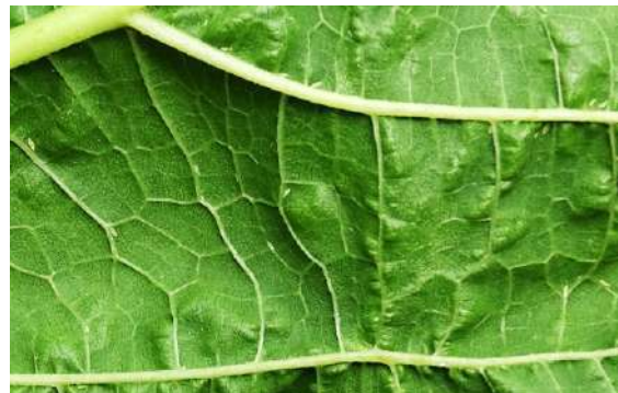
Nymphal stages of thrips

Mulberry thrips reproduce both sexually and parthenogenetically. Each female lays about 30-50 bean shaped whitish eggs measuring 0.25 mm in length and 0.10 mm in breadth on ventral surface of tender leaves which hatch in 6-8 days. The newly hatched first instar nymph is initially colourless and transparent with a pair of dark red compound eyes and gradually changes to light creamy yellow. There are two nymphal stages with 6-7 days. Second instar nymph measures about 0.70 mm length and 0.23 mm breadth. After nymphal stages, it enters into soil and become inactive and non-feeding stages called pre-pupa and pupa. The pupa is yellow coloured, characterized by two pairs of short wing pads. Adults are about 0.8 mm long. Female is yellow in colour, while male is darker. Total lifecycle is completed in 20-22 days with 15 generations in a year.