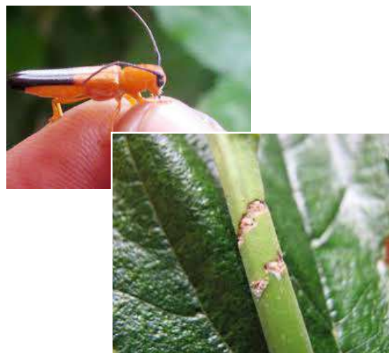
O. artocarp & its damage on mulberry

It girdles and destroys the apical tender leaves. It bores into the stem and makes the seed cuttings unfit for propagation. As the attack advances, twigs shows die back symptom.