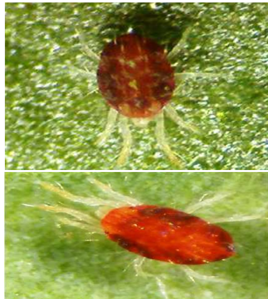
Male & female mites

So far 15 species of mites are found to infest mulberry out of which Tetranychus ludeni , T. equitorius , T. telarius and Aceria mori are the important ones. They are also known as spider mites and are found on almost all the plant parts like leaves, buds, scales, nodes and apical shoots. Adult female lays about 30-70 spherical red colored eggs on the lower surface of the leaves which hatch in 2 to 6 days. The nymphs are pinkish, greenish or orange in color depending on the species whose development takes about 10-12 days. Adults live for 7 to 12 days.