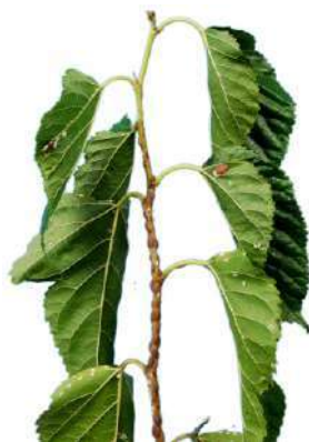
M. maxima affected mulberry plant

Adult female is wingless, oval in shape, measures 4-5 mm length, dark brown in