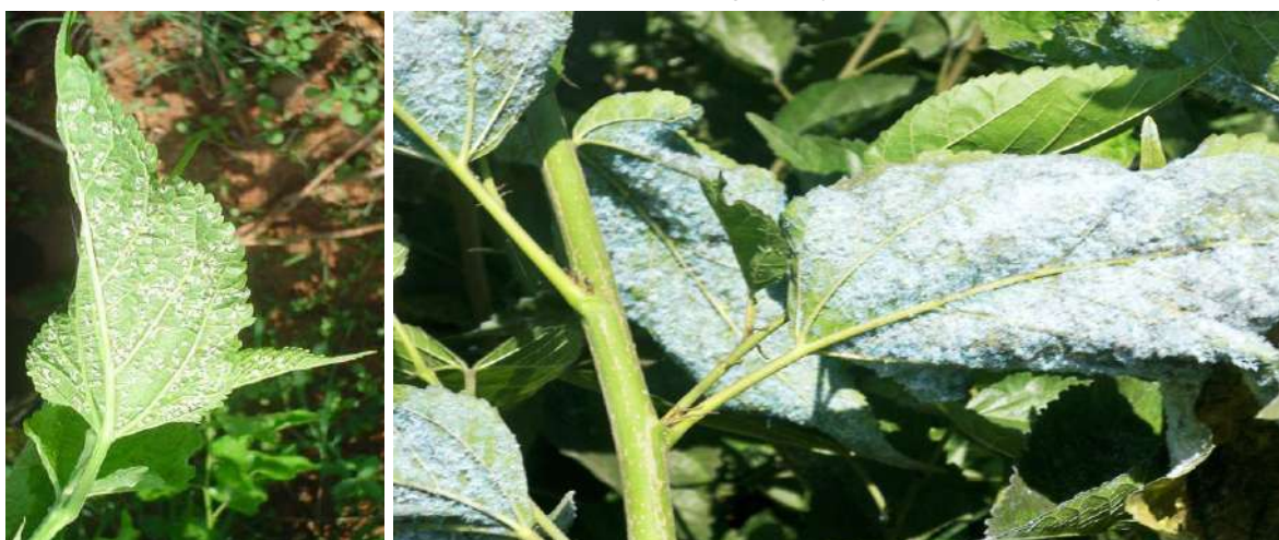
D. decempuncta on ventral side of mulberry leaves

The whiteflies are present throughout the year with high population in summer (March-June) and low during winter (October-January). The population is positively correlated with temperature and negatively correlated with humidity.