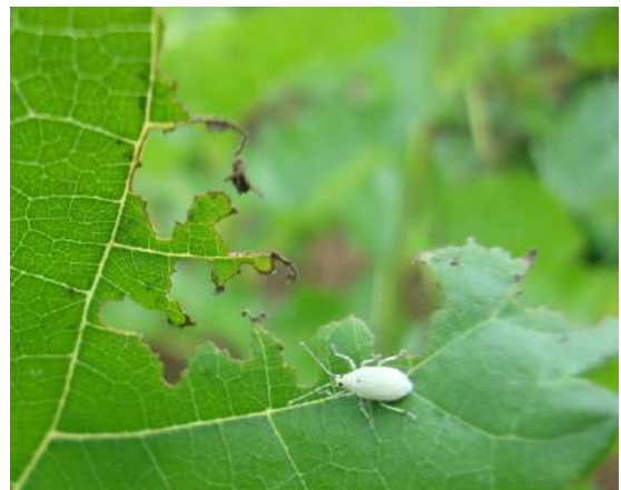
Weevil damage on mulberry