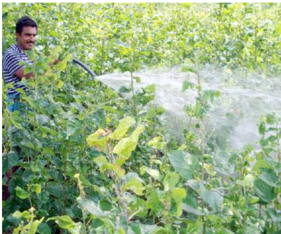
Water jetting in papaya mealybug affected garden