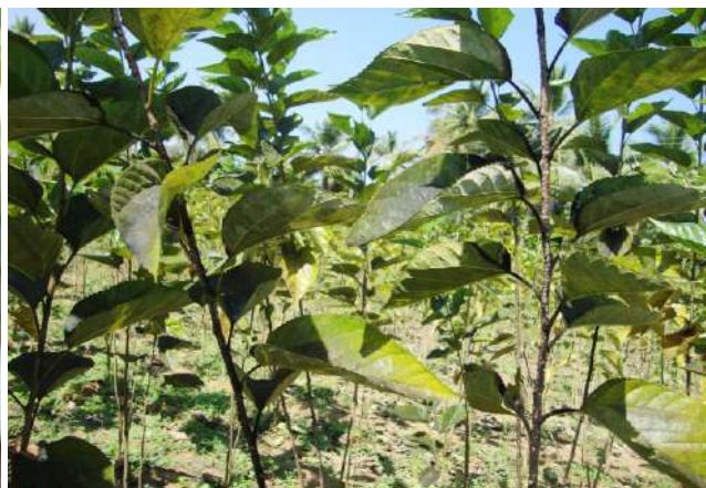
Heavily infested mulberry garden