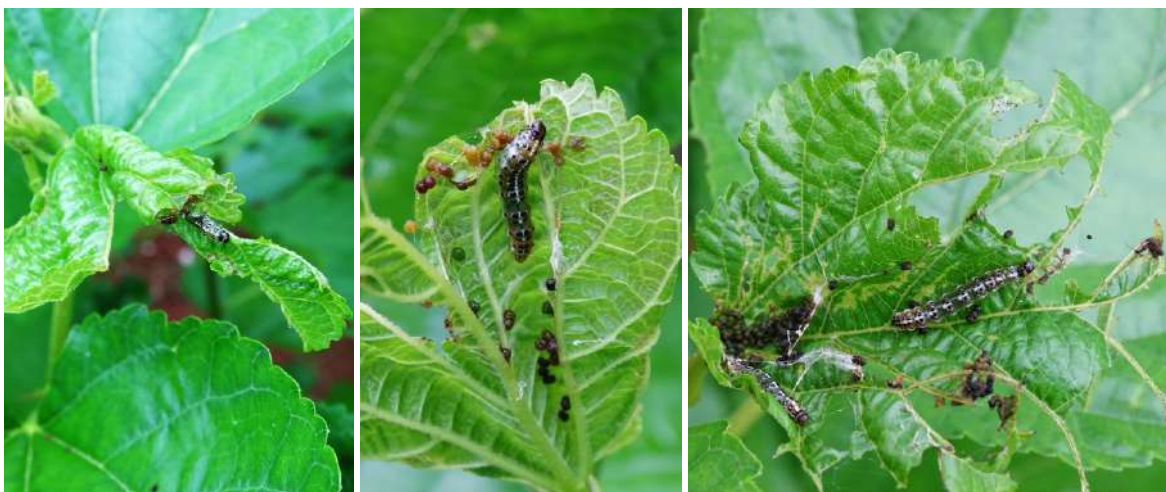
Leaf webber on mulberry