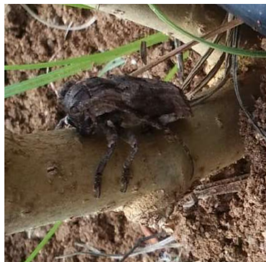
Adult beetle on mulberry stem