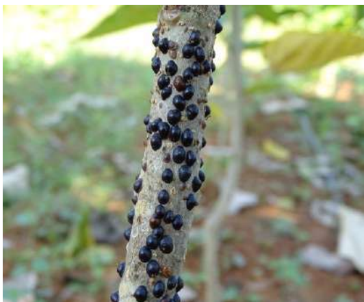
S. nigra infestation on stem

The pest excrete copious amount of honey dew on which sooty moulds develop. This restricts photosynthesis and affects the nutritional value of the leaves. In case of severe infestation the black sooty moulds pollutes the plants of entire garden and make the leaf unfit for feeding silkworm. The movement of ants can also be noticed on the infested plants.