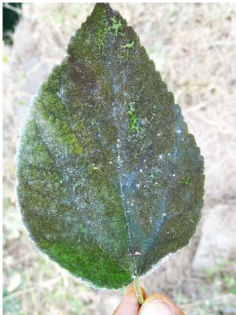
Sooty mould on spiralling whitefly infested leaf

Spiralling whitefly remains on ventral surface of leaves in colonies and cause direct feeding damage by sucking plant sap and indirect damage due to the honeydew and white waxy material produced by the insect. Adults and nymphs feed on plants by sucking plant sap from the leaf through a slender stylet which results in leaf curling, chlorosis, defoliation and stunted growth. Large amount of powdery wax material secreted by all the stages of pest is readily spread through wind, causing nuisance. The honeydew excreted by these insects will fall on the upper surface of the lower leaves which becomes a medium for developing sooty mould fungus, Capnodium sp. This in turn, interferes with photosynthetic process by not allowing enough light to reach the cytochrome tissues of the leaves.